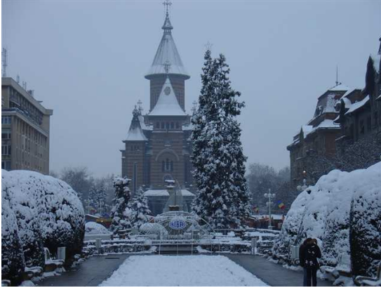
Piața Victoriei blanketed with snow

About the same time we began reading of cold temperatures and wintry weather in Ohio, we began experiencing similar weather here. The week before Christmas, Timisoara received several inches of snow, which is unusual we are told, that blanketed most of the country. The roads in Timisoara were mostly covered for several days as the temperatures were in the teens, and there is little snow removal equipment available. But we still managed to get around, and our friends helped us make it to church. Most of the snow has melted now, and the temperatures are considerably warmer than just two days ago.