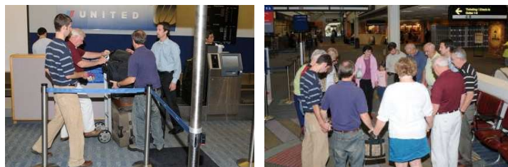
Checking the luggage, and a special time of prayer for our trip.